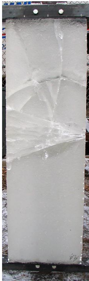
Figures 5 and 6

Destructive test of 1-meter large laminated glass sample, secured only at top and bottom with structural silicone adhesive and clamped to frame via mesh-reinforced shatter-resistant coating.